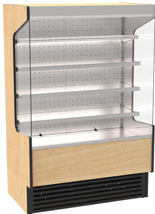
Custom options available, refer to options schedule on next page