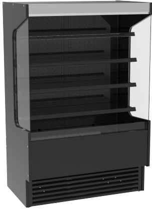
Standard features shown