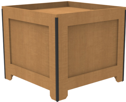
Clear finish shown