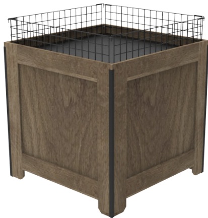
Weathered Wood finish w/optional ABS liner & wire cage shown. Other finishes available - see chart.