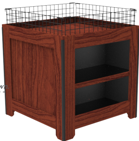
Select Cherry finish w/ optional wire cage shown. Other finishes available - see chart.