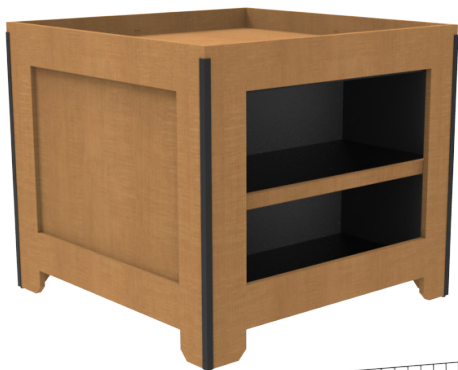
Clear finish shown